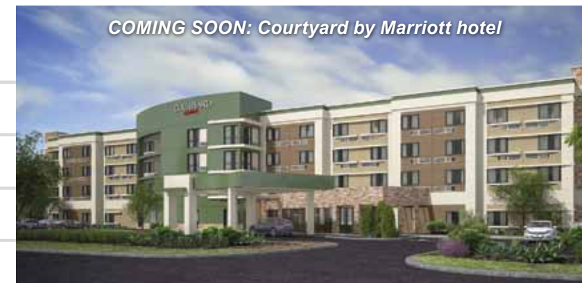
COMING SOON: Courtyard by Marriott hotel

For more information about The Center for Rural Development, visit www.centertech.com .